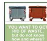
YOU WANT TO GET RID OF WASTE, but do not know how and where?