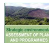
Strategic environmental ASSESSMENT OF PLANS AND PROGRAMMES