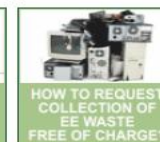
HOW TO REQUEST COLLECTION OF EE WASTE FREE OF CHARGE?